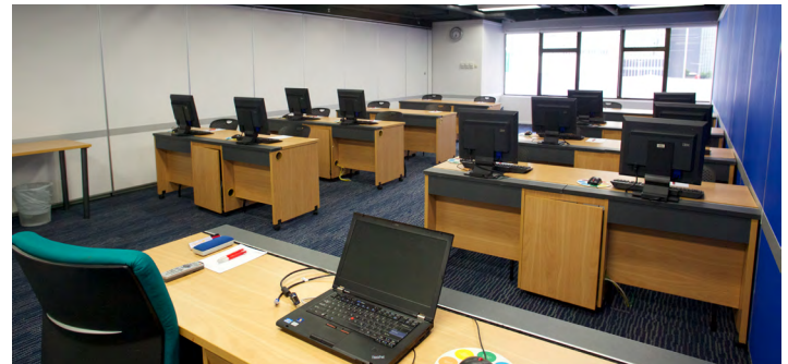
Computer training room