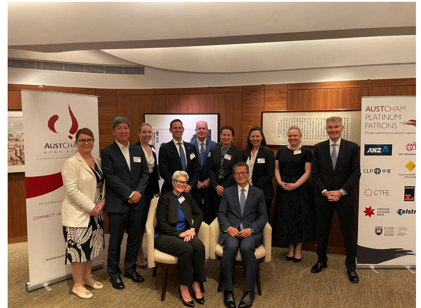
Briefing with Financial Secretary of Hong Kong, Mr Paul Chan